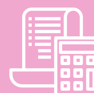
VALID RESIDENTIAL ADDRESS PROOF