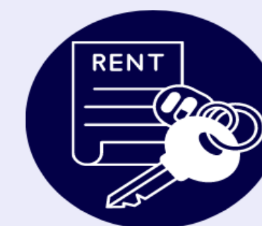
Signed rental agreement with government stamp (within validity)