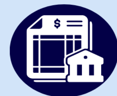
Bank/ Credit card statement